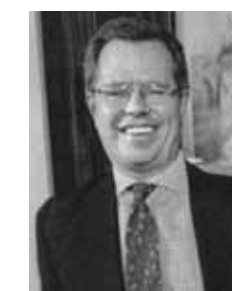
Peck Hayne Gordon Arata McCollam Duplantis & Eagan attorney